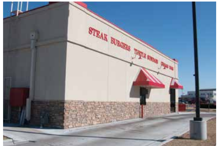
▲ Drive-thru lane features a two window pay then pick-up system