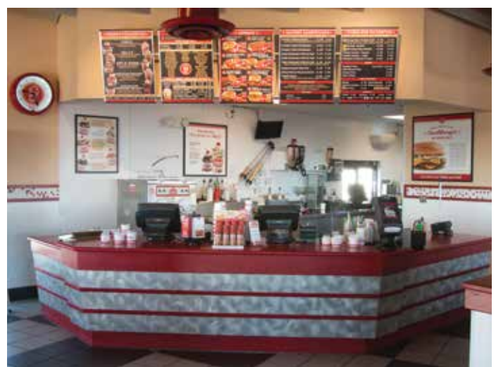
▲ Ordering counter shows menu boards and frozen custard station