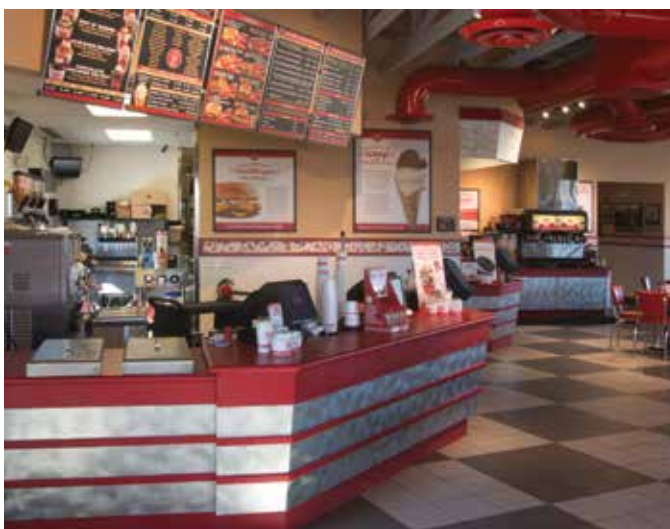
▲ Customer flow is controlled by a series of stations. In the fore ground is the order station, followed by the pick up station and then the drink station