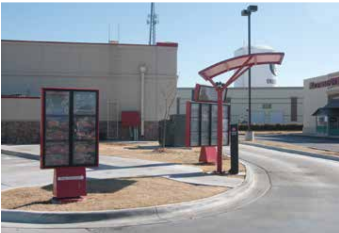
▲ Drive-thru showing curb and gutter, staging menu and ordering station