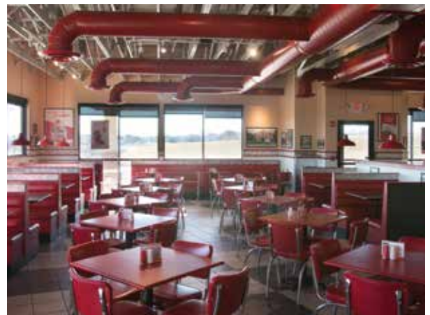
▲ Broken Arrow seating area showing main front door, windows and exposed ventilation system