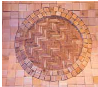
Inlaid wood detail

All the customized elements help give the restaurant a unique and more localized feel. Many of the unique interior features utilize reclaimed wood from palettes and other construction elements. The bar liquor stands are brushed metal with inside lights and glass tops that make the bottles glow. The lights can be programmed to change colors.