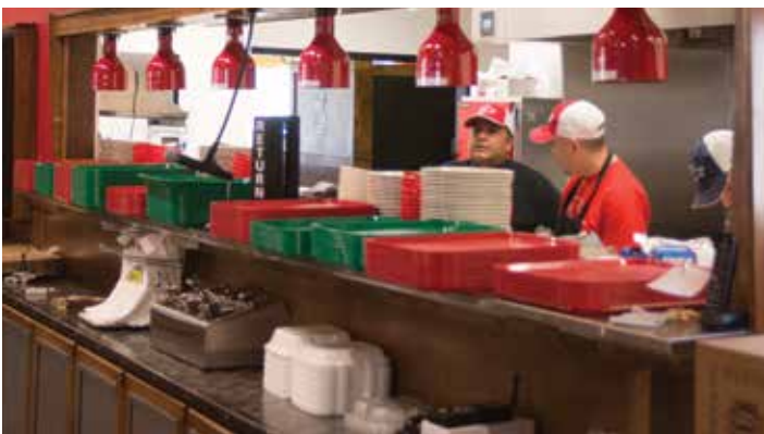
Serving station for expediting meals to customers.