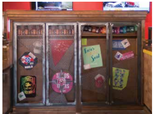
Display case features a metal version of the Wichita flag.

Ink incorporated many custom details and features including inlaid wood walls and decoration, custom metal cabinet doors, surfaces, railings and more.