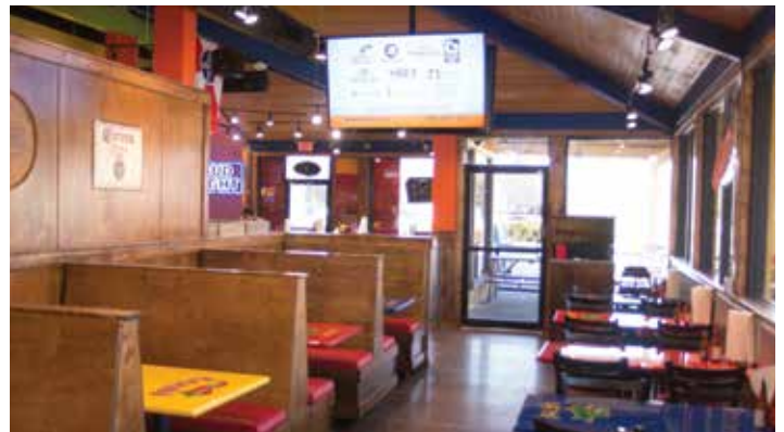
Secondary dining area with wood booths, and TV's