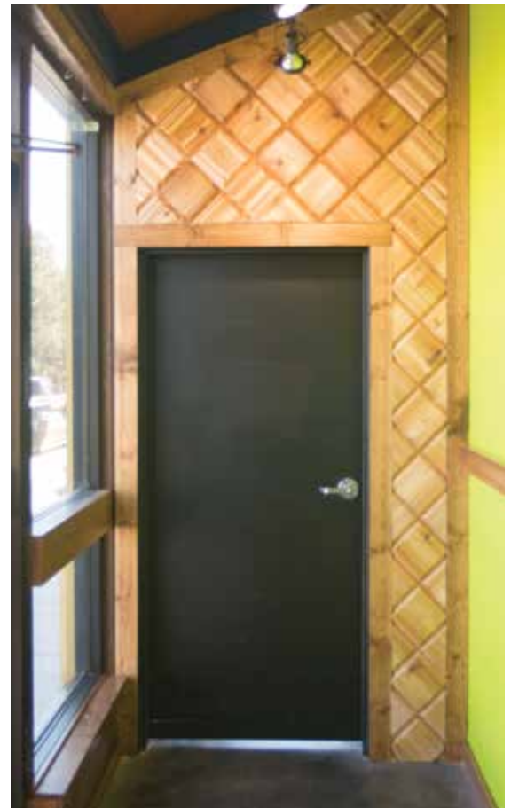
Custom wood wall treatment

The counter in front of the serving window has swirled metal surface and if you look closely on the drink station wall you will see the Fuzzy's Shark logo.