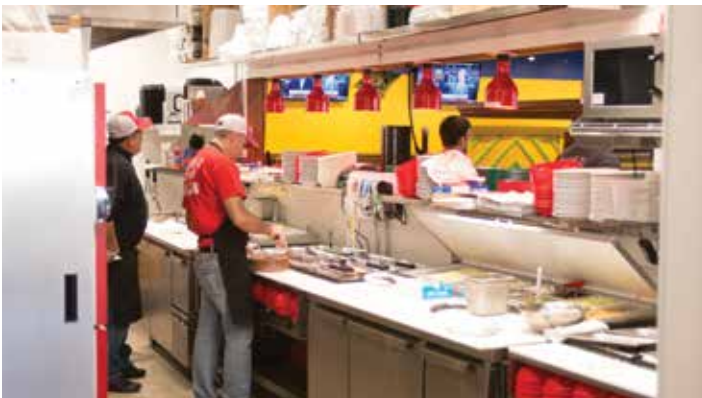
Kitchen prep area