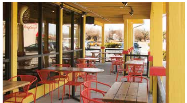
Outdoor patio seating area.