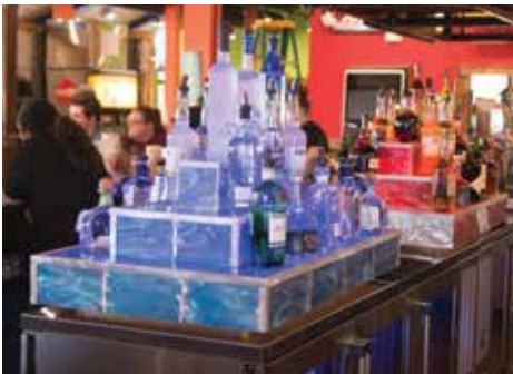
Custom built liquor stands