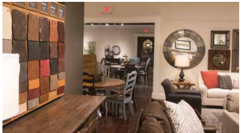
Leather display in a family room showroom, looking into a dining showroom.

Lighting impacts the experience in many ways. It can draw attention to certain areas of the showroom, but it can also show any flaws in finishes, which required painters, floor installers and finishers to pay close attention to details. Additionally, the electricians needed to make sure loads were properly disbursed and all fixtures were easily controlled. The entire environment is made to be flexible from season to season.