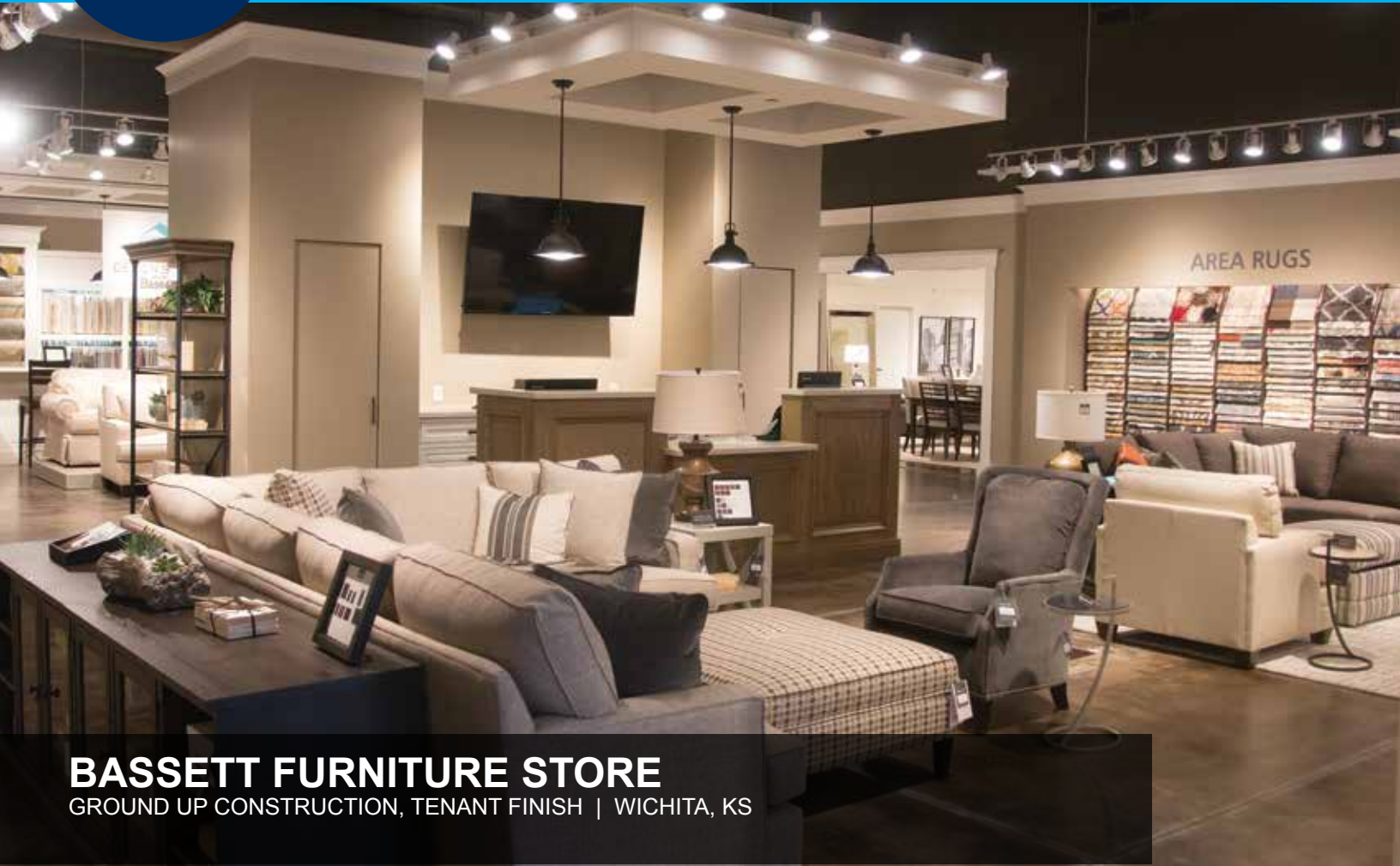
BASSETT FURNITURE STORE GROUND UP CONSTRUCTION, TENANT FINISH | WICHITA, KS