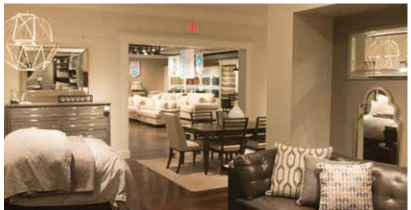
Looking across three vignettes into a couch design center.