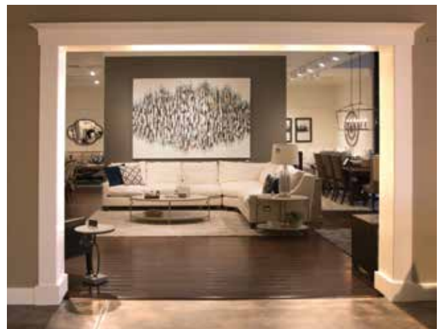
Paint, flooring and trim finish create a sense of arrival.

In showcasing furniture, it is important the customer has an in-store experience similar to what they might experience in their home, so three key elements are vital to the experience, spacing, finishes and lighting. Spacing allows the customer to picture the vignette without distractions of an overcrowded space. It also provides depth in the experience similar to an open floor plan. Finishes including painting, flooring and trim, set the scene for the experience while lighting draws you in, and creates drama that highlights the scene.