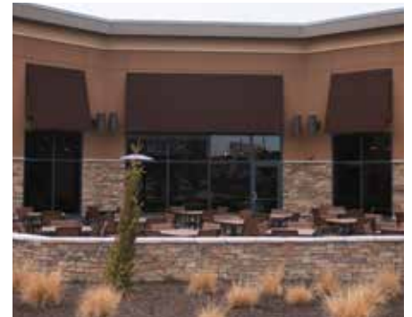
A large outdoor patio extends the seating area and overlooks a spectacular fountain.