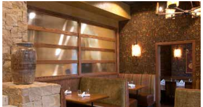
▲ Glass panels separate the kitchen area with dining and the chef's table room.