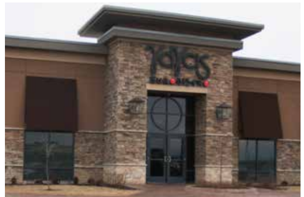
▲ The new location of YaYa's Euro Bistro builds on established brand elements of wood, stone and sophistication.

The construction process starts and ends with strong on-site supervision and leadership. Ink's Project Superintendent was mobilized and on-site day one coordinating vendor schedules with the Project Manager and Project Coordinator to the construction schedule.