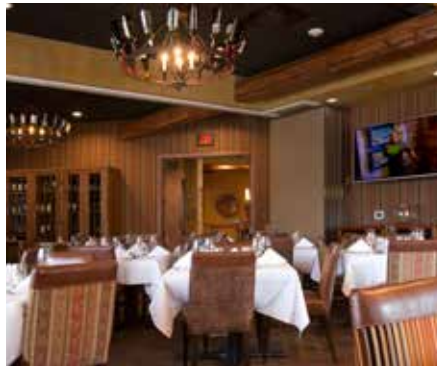
The large meeting room also serves as a second dining room for busy evenings.

Even with an open kitchen area, there are still many back of house items that