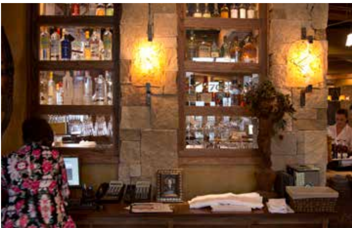
▲ Restaurant entry with stone columns with wood shelves accented by glass fixtures.