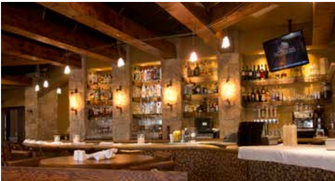
▲ Elevated bar area overlooks the dining area.