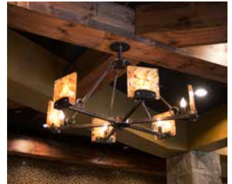
Detail showing the wood beams and unique lighting fixtures.