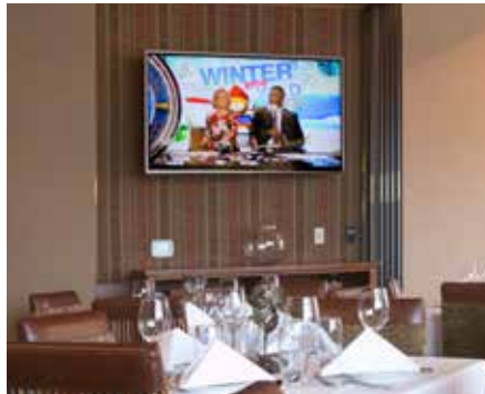
Display monitors are located in the bar area and throughout the meeting rooms.