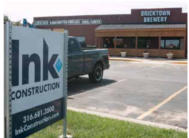
▲ Ink Construction delivered the new Bricktown Brewery location in east Wichita in six weeks including an outdoor patio addition.