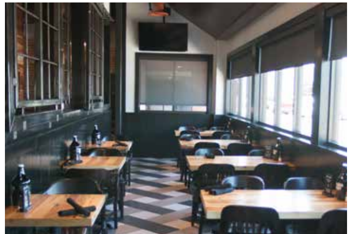
▲ The two main dining areas are divided by custom metal open pane doors that provide separation while still connecting the rooms.