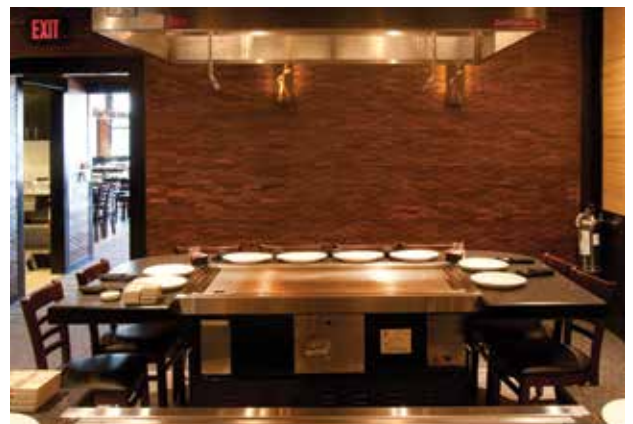
▲ Each remote cooking station required underground gas connection, Type I hood systems with fire suppression systems. Also, note the bamboo dimensional wall and light fixtures