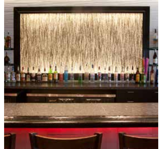
▲ Bar detail showing architectural grass glass, dimensional wall coverings, and under bar lighting