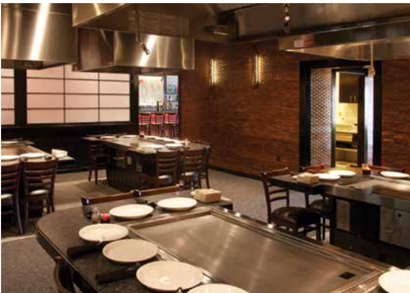
▲ The back seating area features four remote cook stations with easy access to the wait station between dining rooms